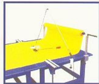
*cutting table is sold separately.