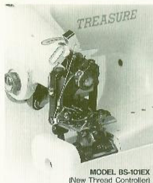
MODEL BS-101EX (New Thread Controller)